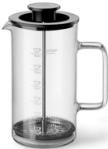
203 coffee maker 100 cl