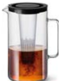
2544/L/S pitcher with ice-insert and sieve 250 cl