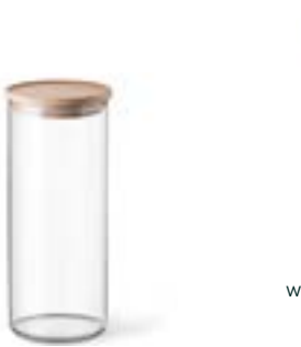
5142/LW storage container with wooden lid 140 cl