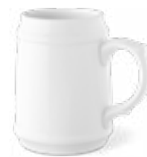
OZD 9803 beer mug 50 cl