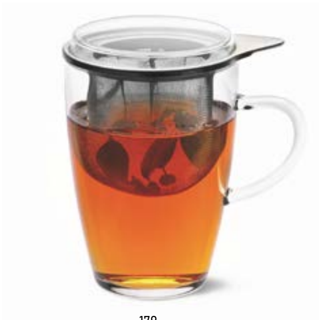
179 tea for one 35 cl