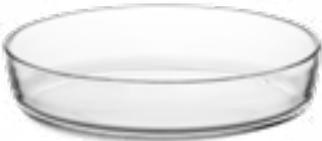
7276 oval baking dish 400 cl