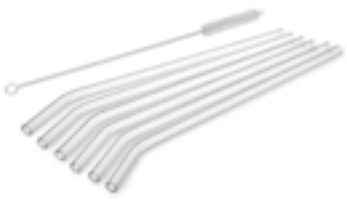
41201/6 glass straws 20 cm