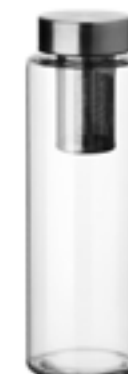
10120/MET pure aqua bottle 100 cl