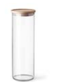
5132/LW storage container with wooden lid 180 cl