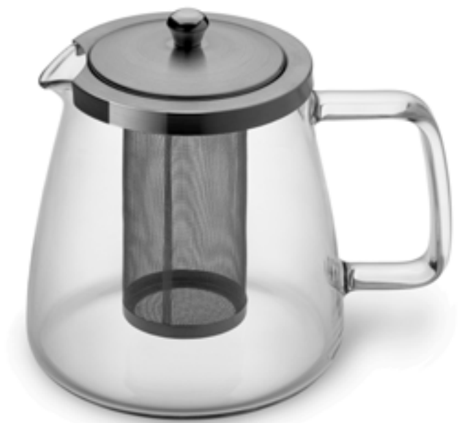
3240/MET Charme jug 110 cl