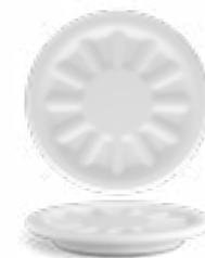
OST 9806 beer coaster 12 cm