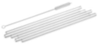
40201/6 glass straws 20 cm