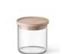
5162/LW storage container with wooden lid 50 cl