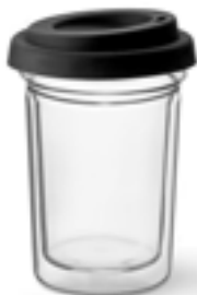
2152/CTG coffee to go 30 cl