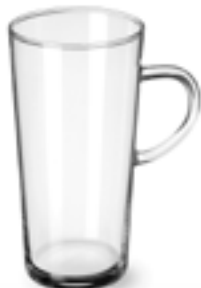
2642/4 Karina mug 35 cl