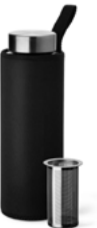
10120/MET/N pure aqua bottle 100 cl