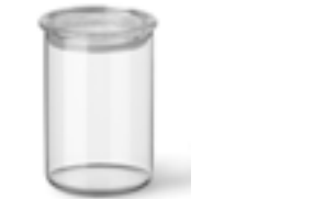
5152/L storage container with plastic lid 80 cl