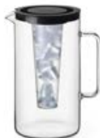
2544/L pitcher with ice-insert 250 cl