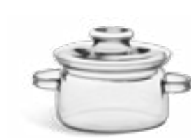
6063 Nyko pot 150 cl