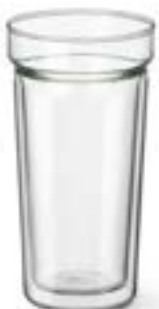
2102/2 glass dual 40 cl