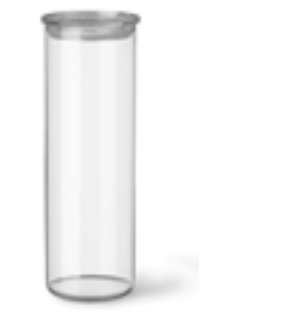
5132/L storage container with plastic lid 180 cl