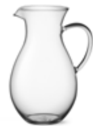
20020 jug Klasik 100 cl