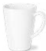
OPT0627 mug 27 cl