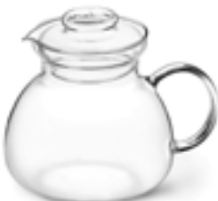
3243 Marta jug 150 cl