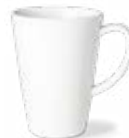
OPT0647 mug 47 cl