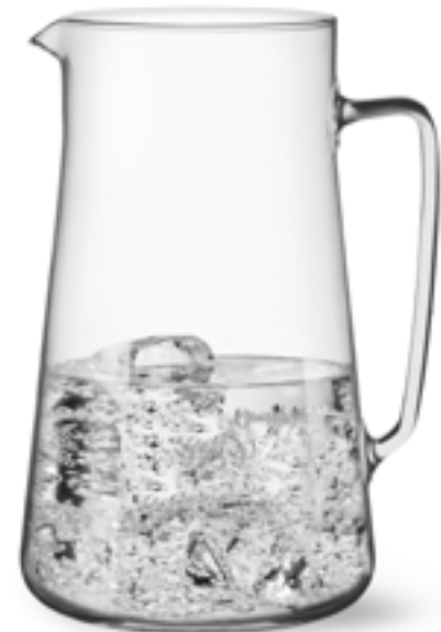
20070 jug Agra 250 cl