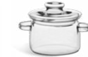
6073 Nyko pot 200 cl