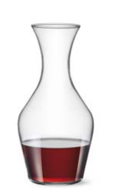
10010 carafe Rondo 100 cl