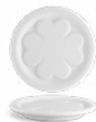
OST 9807 beer coaster 12 cm