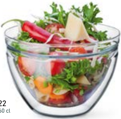
5522 bowl 60 cl