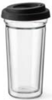
2102/CTG coffee to go 40 cl