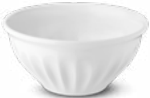
RIB1415 bowl 15 cm