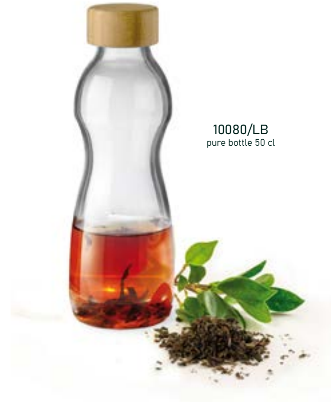
10080/LB pure bottle 50 cl