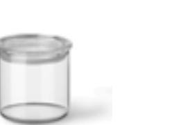
5162/L storage container with plastic lid 50 cl