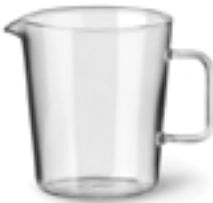
5482 milk mug 25 cl