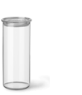
5142/L storage container with plastic lid 140 cl