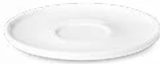
OPT1716 saucer 16 cm