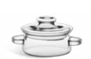
6053 Nyko pot 100 cl