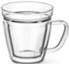
2363/2 glass lungo 18 cl