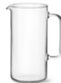
20060 jug cylinder 200 cl