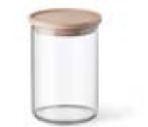
5152/LW storage container with wooden lid 80 cl