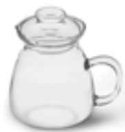
3553 Jana jug 60 cl