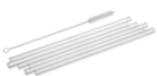
40151/6 glass straws 15 cm