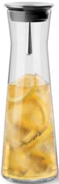
2546 carafe Indis 110 cl