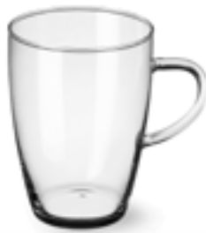
2612/4 Lyra mug 40 cl