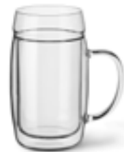
2312 beer glass 50 cl