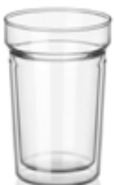
2152/2 glass dual 30 cl