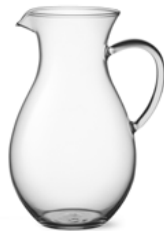
20010 jug Klasik 150 cl